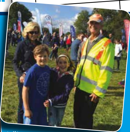
With my family at Prestwold for the Primary Schools xc. I have enjoyed being a member of a local running club and now spend time as a volunteer acting as Athletics Official for various races in the Midlands.