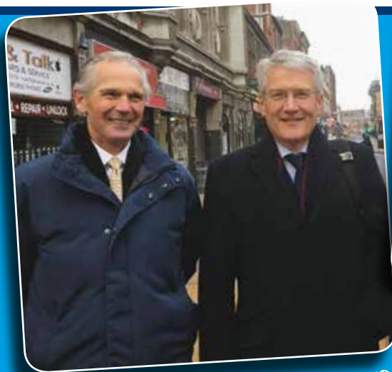
With Transport Minister, Andrew Jones MP February 2017.