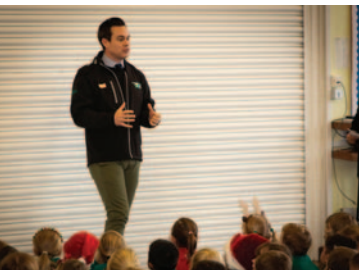
Speaking to Fleckney school children about the Council's work

I would be honoured if residents trusted me once again by re-electing me as their County Councillor".