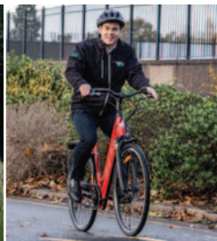
Launching a new electric bike scheme