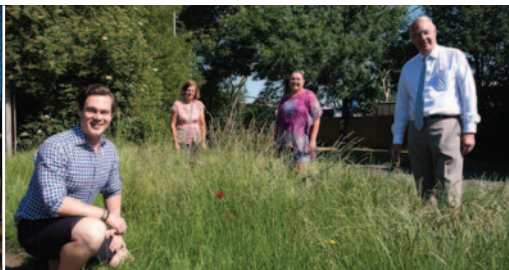
Planting wildflowers in Fleckney