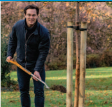
Tree planting in the County