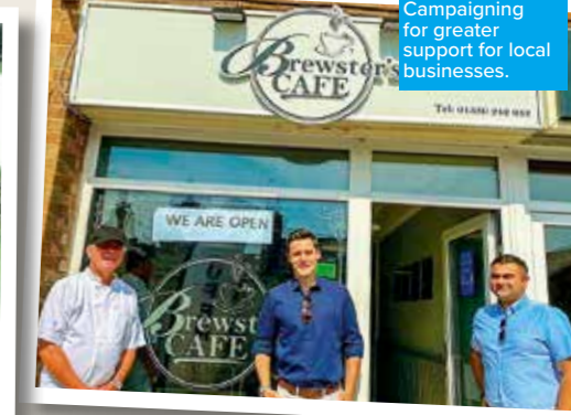
Campaigning for greater support for local businesses.