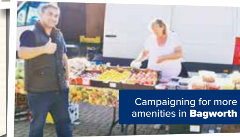
Campaigning for more amenities in Bagworth