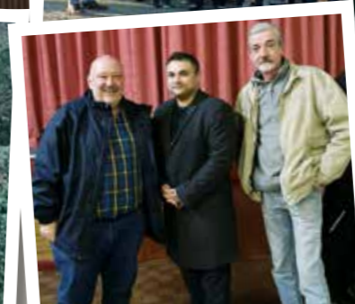
Thornton Public Meeting: Working with The County Council, Borough Councillors, and Severn Trent for improvements to parking in and around Thornton Reservoir.