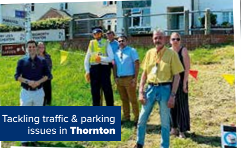
Tackling traffic & parking issues in Thornton