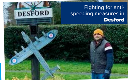
Fighting for anti-speeding measures in Desford