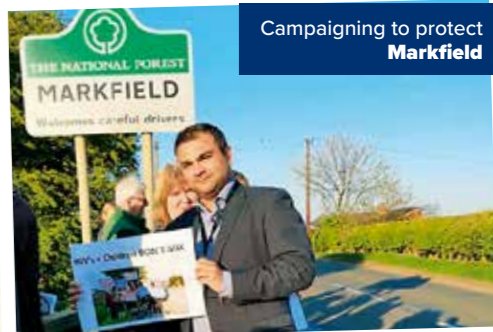
Campaigning to protect Markfield

01455 824733 @peterbedfordmdt @peterbedfordmdt