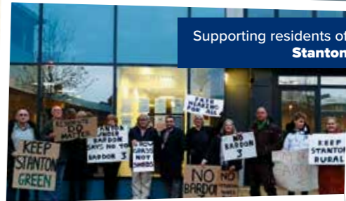
Supporting residents of Stanton