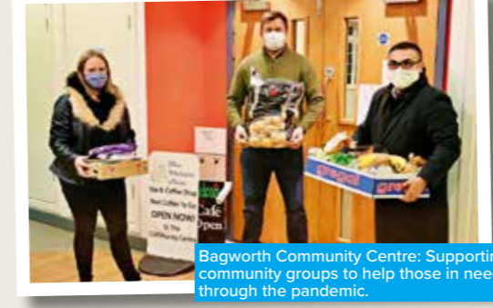
Bagworth Community Centre: Supporting community groups to help those in need through the pandemic.