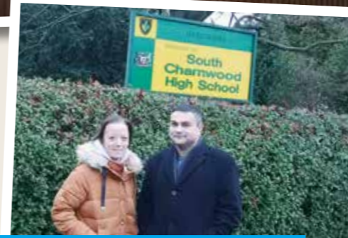
South Charnwood School: Listening to concerns over the walk to South Charnwood High School and securing £15k of funding towards improvement measures.