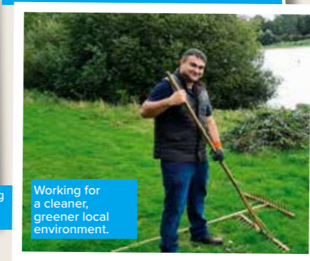
Working for a cleaner, greener local environment.